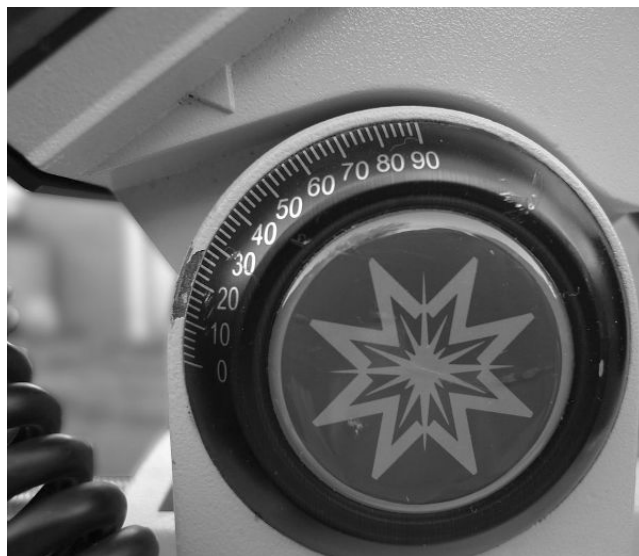
Above: The observer's latitude is matched to a basic elevation scale on the equatorial mount's polar axis.

There is a second way; using the Sun to cast a shadow which will lie on the north-south axis when the Sun is due south. But when is that? It depends on your longitude and also on the equation of time. The time that the Sun is due south can be found if you have a program like Stellarium (free to download). Set it to observe from your location in lat and long, and then to 12 noon on a day when the Sun is shining. Remove the atmosphere, put on the azimuthal grid to show the meridian and look due south — you should see the Sun somewhere in the south, now adjust