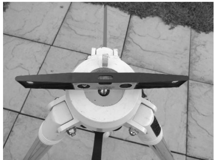
Above: The tripod, level and aligned, ready for the equatorial head.